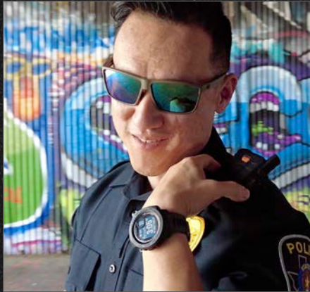
Compact, ruggedized, wearable broadband communications device for heads up operation..