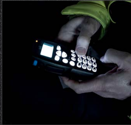
Intelligent vehicle network and edge computing platform in a familiar radio form factor 1 .