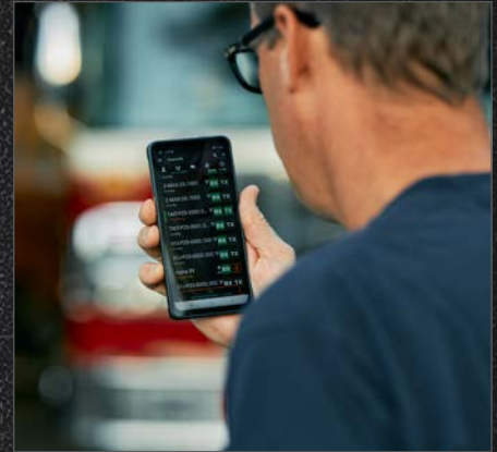
Broadband smart devices can bridge the gap between networks, devices and user locations.